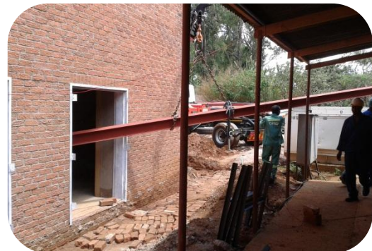
Positioning of support beams for ducting in progress