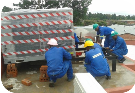
Positioning of Aircon Units on rooftop