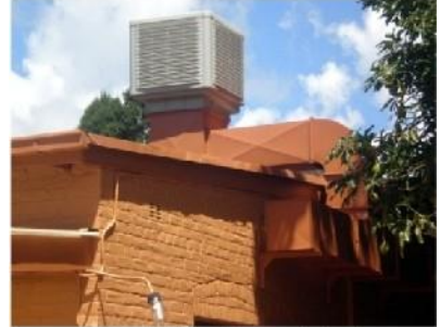
3. Ducting painted