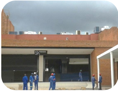
Project nearly complete..