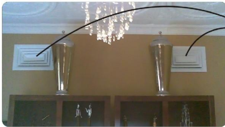
4. Final result

Diffusers built into the walls for air flow as desired by the user within the building.