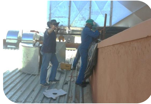
work in progress!