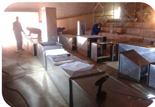
Ducting being checked for accuracy of measurements and further customizing to exact specifications.