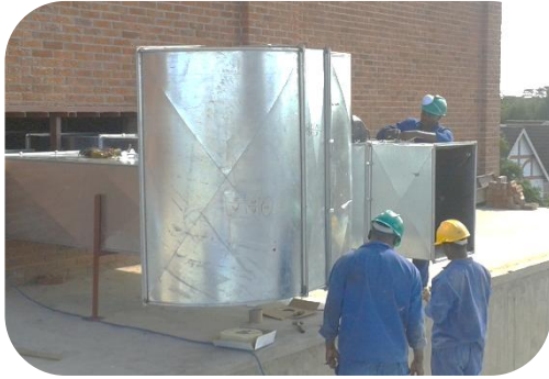
Ducting being positioned for airconditioning chillers