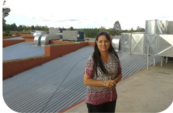
Chief Inspector on site to check if the boys did an excellent job!