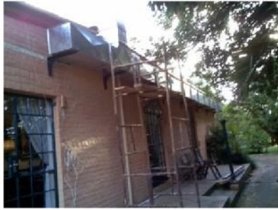
1. Work begins, ducting installation

Below are images of an Evaporative Cooler system installed by Cold Control