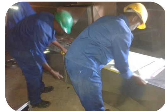
Ducting measurements begin