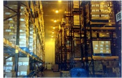
1300m 2 of Cold Store for BAK Storage