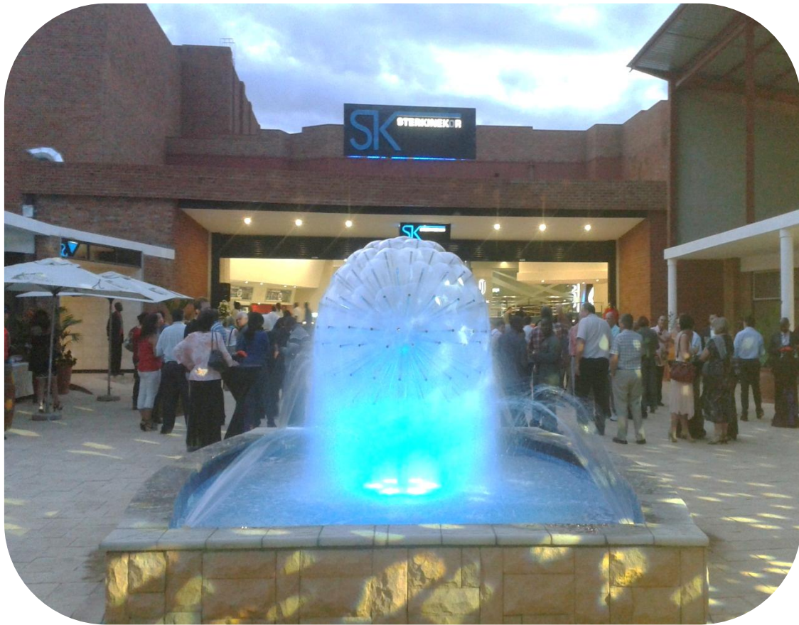
The final result!