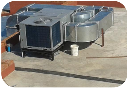
Ducting and all units in place!