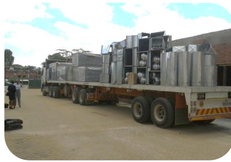
Arrival of Ducting from South Africa