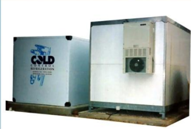
Insulated Air Conditioned Shelters for Econet & Teelcel