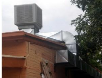
2. Ducting and Evaporative Cooler installation complete